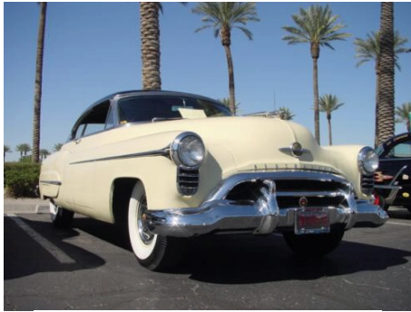
Jim's 1950 98